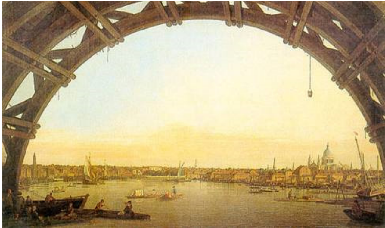
Canaletto, London Seen through an Arch of Westminster Bridge , 1746-47